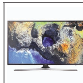
TV SAMSUNG UHD EUR 85.00/day (diagonal screen: 163 cm) Code 025 010 130 047