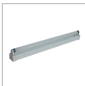
Corp fluorescent tip SS30 EUR 27.00 cu un tub D-170 - A Cod 019.010.190.001