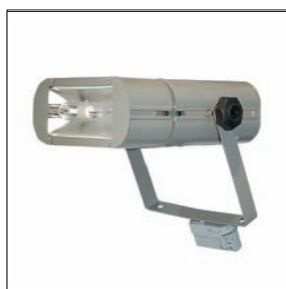
Reflector IVEN HQI 150W EUR 50.00 Cod 019.010.200.005