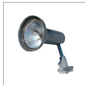
Spot halogen 100W EUR 24.00 SY STAR Cod 019.010.185.000