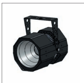
Reflector LED VIRGO EUR 55.00 40W 4350 LM 4100 K Cod 019.010.200.045