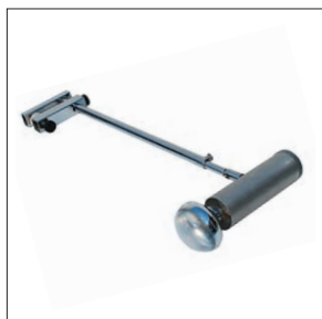
Lampa spot cu brat 100W EUR 21.00 Cod 019.010.181.000