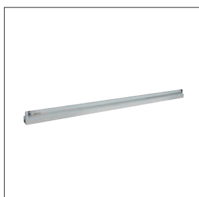
Lampa fluorescenta FIA EUR 24.00 cu instalatie electrica completa 1x40W Cod 019.010.110.000