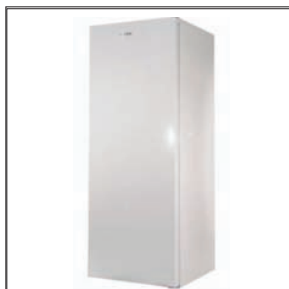
Frigider ARCTIC 255 l EUR 80.00 Cod 025 010 020 199