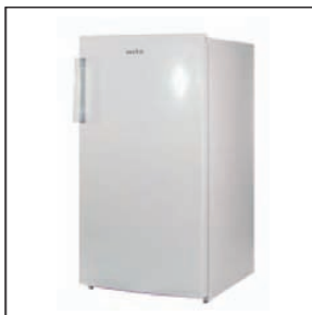
Frigider ARCTIC FB 155 EUR 36.00 Cod 025 010 020 198