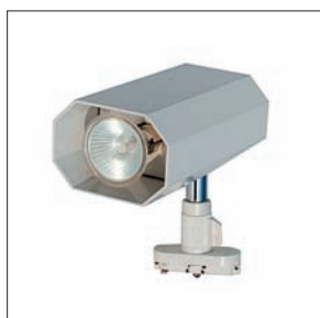
Spot halogen SY STAR 50W(A) EUR 24.00 Cod 019.010.186.000