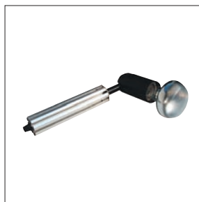
Lampa spot stut OCTANORM EUR 21.00 Cod 019.010.187.000