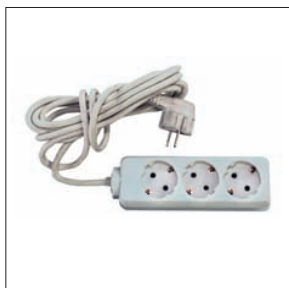
Prelungitor 230V, 10A, 3m EUR 18.00 Cod 019.010.277.000