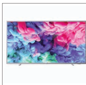
TV LED SMART 4K, EUR 55.00/zi UHD ultrasubtire (diagonala ecran: 126 cm) Cod 025 010 130 045