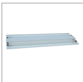
Corp fluorescent tip OCTANORM EUR 29.00 cu doua tuburi D-171 Cod 019.010.200.000