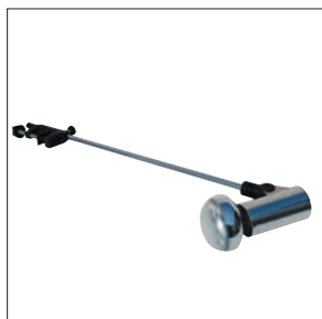
Lampa spot cu brat EUR 21.00 Cod 019.010.180.000