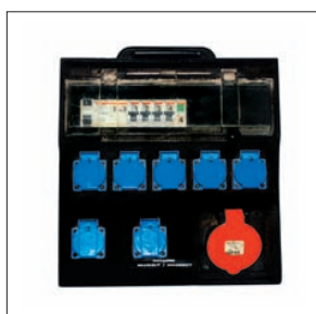
Panou Electric 380V/220V EUR 210.00 Cod 019.010.265.000