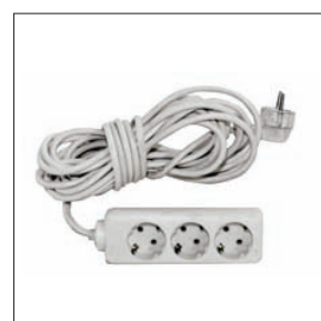
Prelungitor 230V, 10A, 5m EUR 18.00 Cod 019.010.279.000