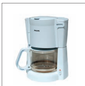
Filtru de cafea EUR 10.00 Cod 025.010.120.010