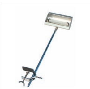
Reflector cu brat 300W EUR 50.00 Cod 019.010.200.010