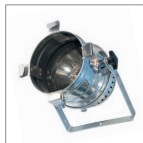
Reflector PAR64 500-1000W EUR 55.00 Cod 019.010.200.020