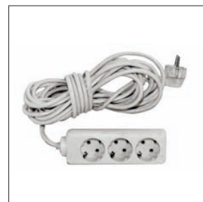
Prelungitor 230V, 10A, 5m EUR 18.00 Cod 019.010.279.000