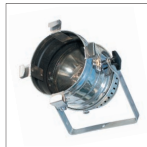
Reflector PAR64 500-1000W EUR 55.00 Cod 019.010.200.020