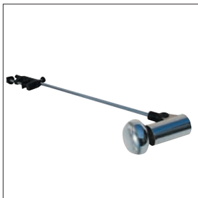
Lampa spot cu brat EUR 21.00 Cod 019.010.180.000