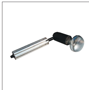
Lampa spot stut OCTANORM EUR 21.00 Cod 019.010.187.000