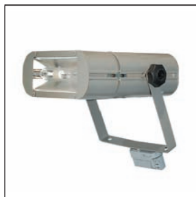
Reflector IVEN HQI 150W EUR 50.00 Cod 019.010.200.005