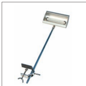
Reflector cu brat 300W EUR 50.00 Cod 019.010.200.010