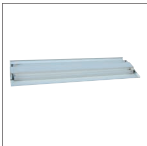
Corp fluorescent tip OCTANORM EUR 29.00 cu doua tuburi D-171 Cod 019.010.200.000