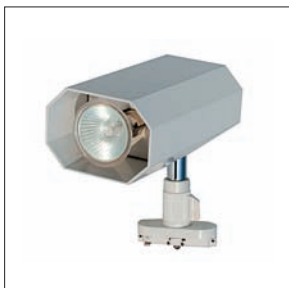
Spot halogen SY STAR 50W(A) EUR 24.00 Cod 019.010.186.000