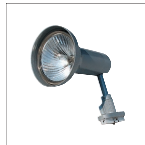
Spot halogen 100W EUR 24.00 SY STAR Cod 019.010.185.000