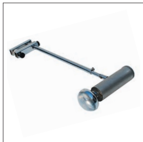
Lampa spot cu brat 100W EUR 21.00 Cod 019.010.181.000