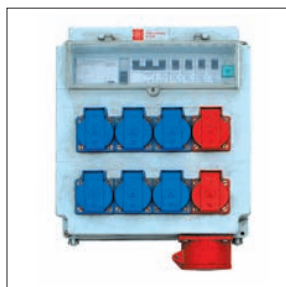
Panou Electric OCTANORM EUR 210.00 Cod 019.010.275.000