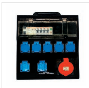
Panou Electric 380V/220V EUR 210.00 Cod 019.010.265.000