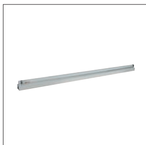
Lampa fluorescanta FIA EUR 24.00 cu instalatie electrica completa 1x40W Cod 019.010.110.000