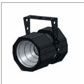
Reflector LED VIRGO EUR 55.00 40W 4350 LM 4100 K Cod 019.010.200.045