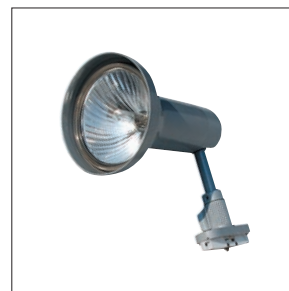
Spot halogen 100W EUR 24.00 SY STAR Cod 019.010.185.000