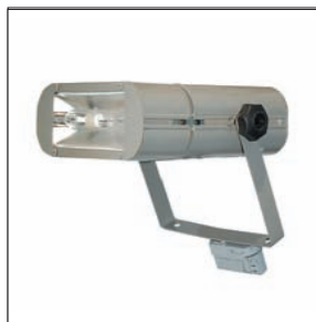
Reflector IVEN HQI 150W EUR 50.00 Cod 019.010.200.005