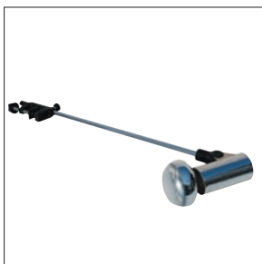
Lampa spot cu brat EUR 21.00 Cod 019.010.180.000