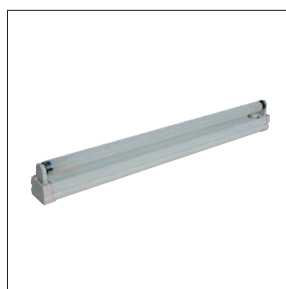
Corp fluorescent tip SS30 EUR 27.00 cu un tub D-170 - A Cod 019.010.190.001