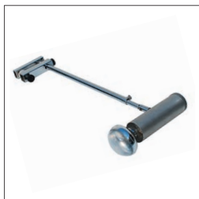
Lampa spot cu brat 100W EUR 21.00 Cod 019.010.181.000