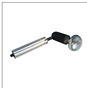
Lampa spot stut OCTANORM EUR 21.00 Cod 019.010.187.000