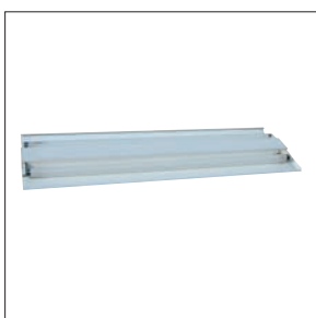
Corp fluorescent tip OCTANORM EUR 29.00 cu doua tuburi D-171 Cod 019.010.200.000