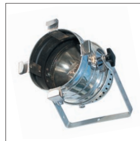
Reflector PAR64 500-1000W EUR 55.00 Cod 019.010.200.020