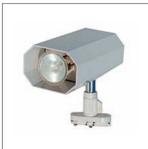
Spot halogen SY STAR 50W(A) EUR 24.00 Cod 019.010.186.000