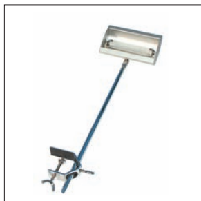
Reflector cu brat 300W EUR 50.00 Cod 019.010.200.010