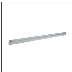
Lampa fluorescenta FIA EUR 24.00 cu instalatie electrica completa 1x40W Cod 019.010.110.000