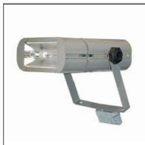
Reflector IVEN HQI 150W EUR 50.00 Cod 019.010.200.005