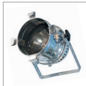
Reflector PAR64 500-1000W EUR 55.00 Cod 019.010.200.020