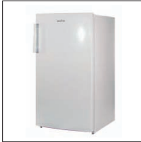
Frigider ARCTIC FB 155 EUR 36.00 Cod 025 010 020 198