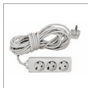
Prelungitor 230V, 10A, 5m EUR 18.00 Cod 019.010.279.000