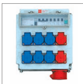
Panou Electric OCTANORM EUR 210.00 Cod 019.010.275.000