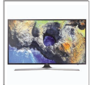
TV SAMSUNG UHD EUR 85.00/day (diagonal screen: 163 cm) Code 025 010 130 047