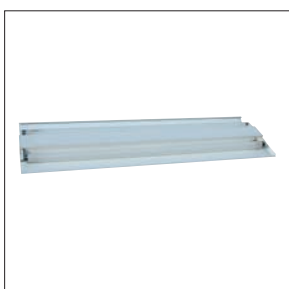
Corp fluorescent tip OCTANORM EUR 29.00 cu doua tuburi D-171 Cod 019.010.200.000