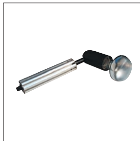
Lampa spot stut OCTANORM EUR 21.00 Cod 019.010.187.000