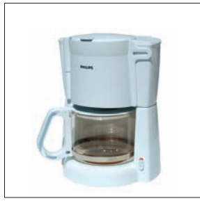
Filtru de cafea EUR 10.00 Cod 025.010.120.010