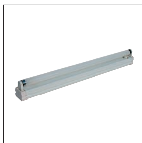
Corp fluorescent tip SS30 EUR 27.00 cu un tub D-170 - A Cod 019.010.190.001