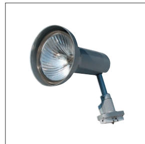
Spot halogen 100W EUR 24.00 SY STAR Cod 019.010.185.000