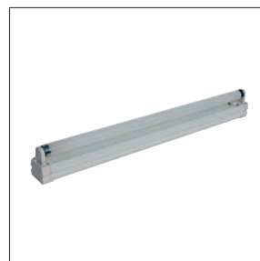
Corp fluorescent tip SS30 EUR 27.00 cu un tub D-170 - A Cod 019.010.190.001