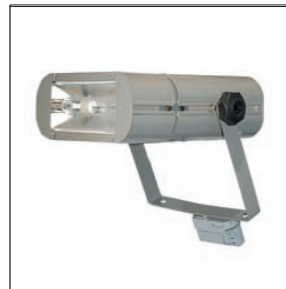
Reflector IVEN HQI 150W EUR 50.00 Cod 019.010.200.005