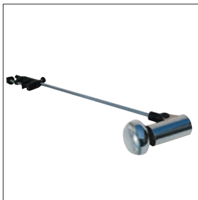
Lampa spot cu brat EUR 21.00 Cod 019.010.180.000