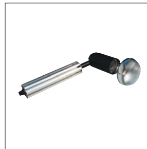
Lampa spot stut OCTANORM EUR 21.00 Cod 019.010.187.000