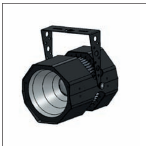
Reflector LED VIRGO EUR 55.00 40W 4350 LM 4100 K Cod 019.010.200.045