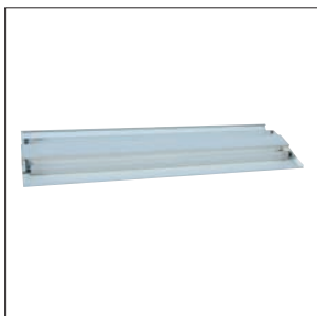
Corp fluorescent tip OCTANORM EUR 29.00 cu doua tuburi D-171 Cod 019.010.200.000