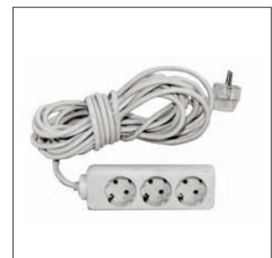
Prelungitor 230V, 10A, 5m EUR 18.00 Cod 019.010.279.000