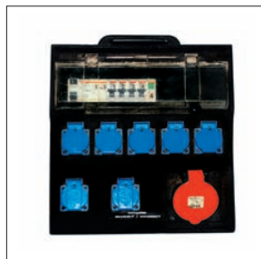
Panou Electric 380V/220V EUR 210.00 Cod 019.010.265.000