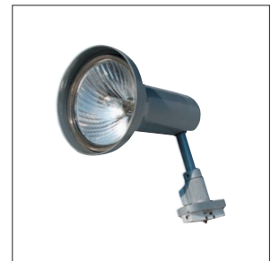
Spot halogen 100W EUR 24.00 SY STAR Cod 019.010.185.000