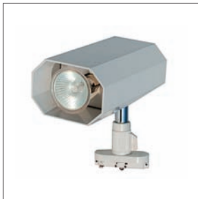
Spot halogen SY STAR 50W(A) EUR 24.00 Cod 019.010.186.000