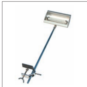
Reflector cu brat 300W EUR 50.00 Cod 019.010.200.010