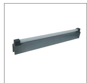
Corp fluorescent tip SS30 EUR 24.00 cu un tub D-170 Cod 019.010.190.000