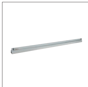
Lampa fluorescenta FIA EUR 24.00 cu instalatie electrica completa 1x40W Cod 019.010.110.000