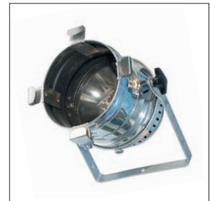
Reflector PAR64 500-1000W EUR 55.00 Cod 019.010.200.020