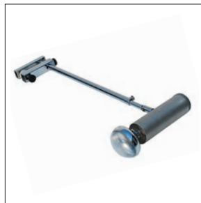
Lampa spot cu brat 100W EUR 21.00 Cod 019.010.181.000